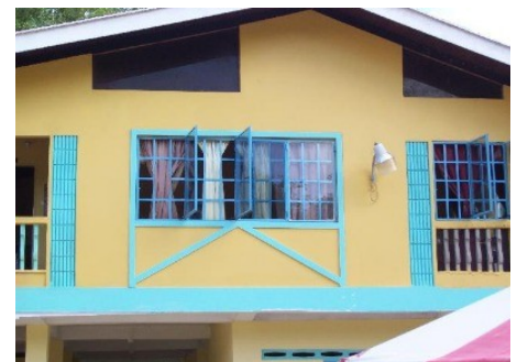
MATURA R.E.A.D.I. CENTRE

We are ready to serve those in need of our assistance and to help them along the path of healing.